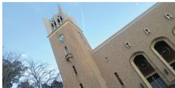
Specialized support for national universities and top-level private universities

Intermediate: CLIL (content and language integrated learning) Content learning and language learning for mastering listening, reading, writing, and speaking