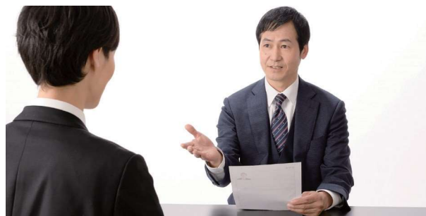
Support for Japanese Language Proficiency Test