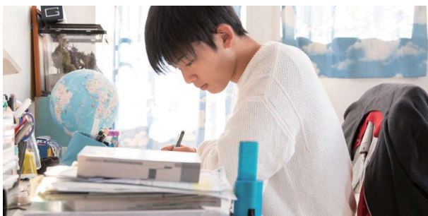
Support for Japanese admission Examinations

-Intensive class for examination for general and mathematical subjects